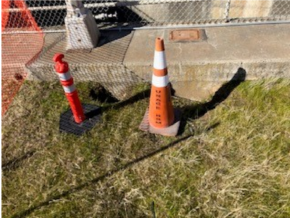
Figure 2. Photo illustrating the size of one sink hole developing near The Dalles Dam south fishway entrance. Along the southern fishway wall.

Type of outage required – No outage required; all work will be completed outside of the fishway.